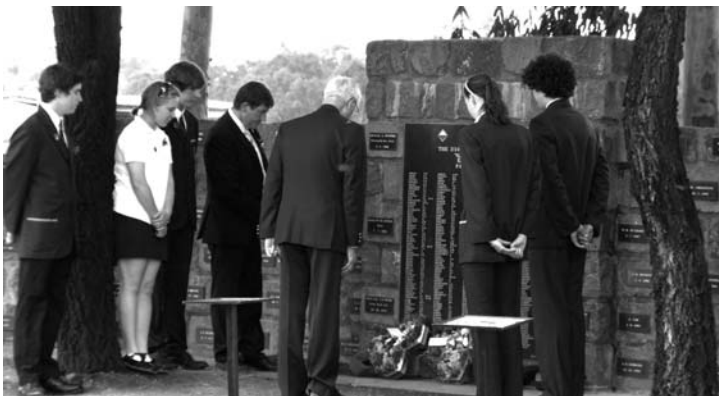
Laying the Wreath