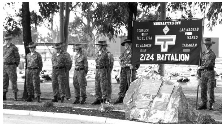
Cadets from Wangaratta's 33ACU with the Battalion's Standard.