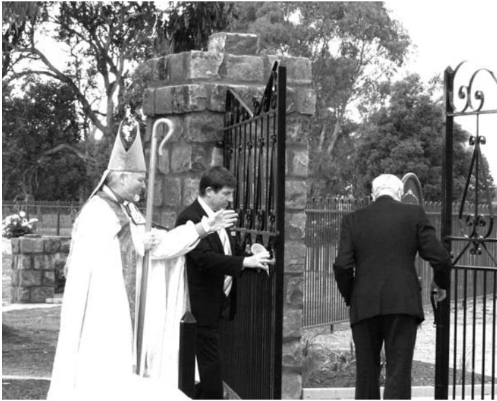
The Bishop of Wangaratta, His Honour the Mayor and our President officially opening the Cemetery Gates.